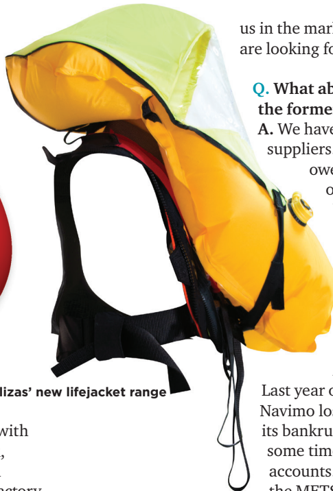
▲ New launches: Round fender by Ocean and Lalizas' new lifejacket range

development project that concluded last year with the acquisition of a 13,000m 2 facility in Pernik, Bulgaria. Local press reported the move worth 3.8m Lev (US$2.1m) plus $2m for the set up factory upgrade. The site is scheduled to enter operation in the coming months and production will focus on the fender product line. Lalizas estimates the operation will employ 100-200 people.